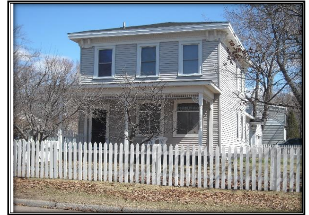
Howard/Kumm House, 1864 - This house is now located at 4115 Bank Drive, La Crosse. Originally located at 315 South 3 rd Street, it was moved to its current location in 1954. During the 1880s it was used as a boarding house.