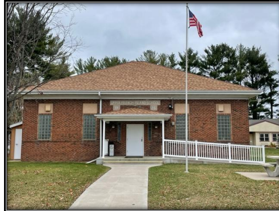
Upper French Island School* - The Upper French Island School was built in 1925 and is located at the northeast corner of Plainview Road and Lakeshore Drive on French Island. Today, it is the home of the Campbell Community Center.