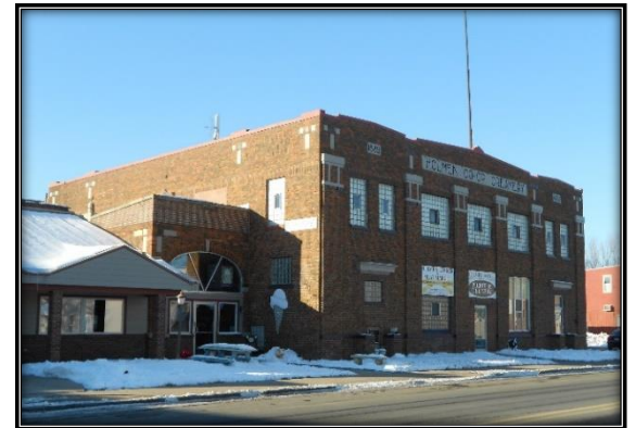
Holmen Cooperative Creamery* - The Holmen Cooperative Creamery was organized in 1889 with a stone building erected in 1895. That stone building was replaced in 1922 by the building in the photo, which at the time would have been a modern structure with new equipment. Today, this property houses a meat processing and locker plant.